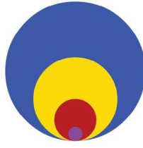
Use of Funds

Programs Food & Supplies Bursaries Operating & Administration